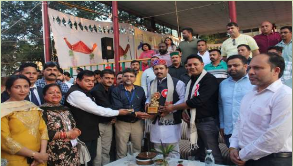
Glimpses of Annual Function