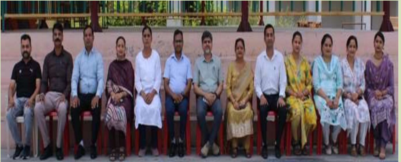
Teaching Staff & Non-Teaching Staff