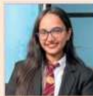
Kritika 8 th in HPU Merit-BBA