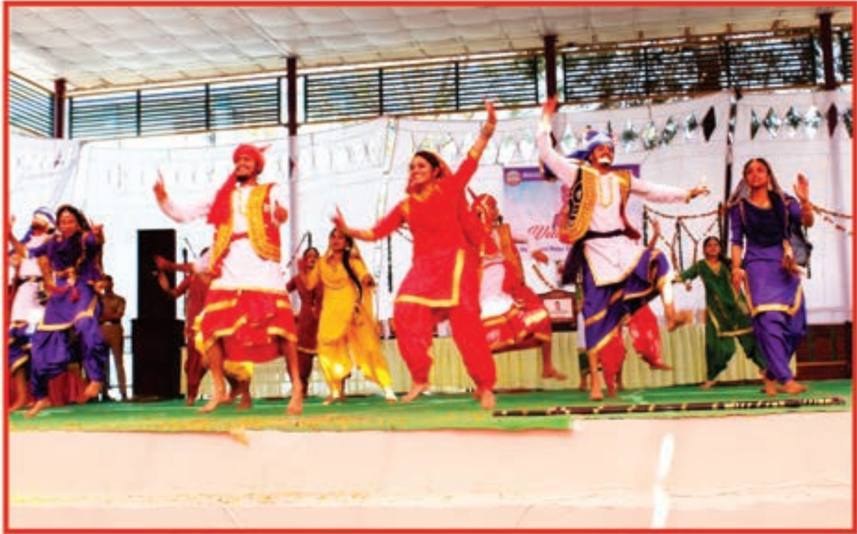
STUDENT OF THE COLLEGE PRESENTING BHANGRA DURING ANNUAL PRIZE DISTRIBUTION FUNCTION